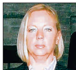
FALSE IDOL? Deborah Meaden.